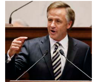
Tennessee Governor Bill Haslam