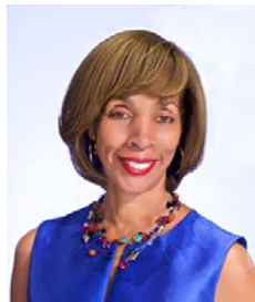
Baltimore Mayor Catherine Pugh