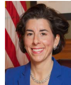
Rhode Island Governor Gina Raimondo